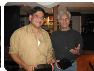
Invitation Doubles - 24th Oct 2012