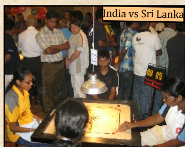
India vs Sri Lanka

[Please note that we do not have any more details of the results of the women team event other than the final standings.]