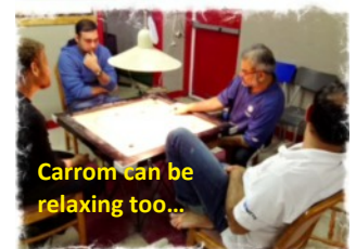
Carrom can be relaxing too...